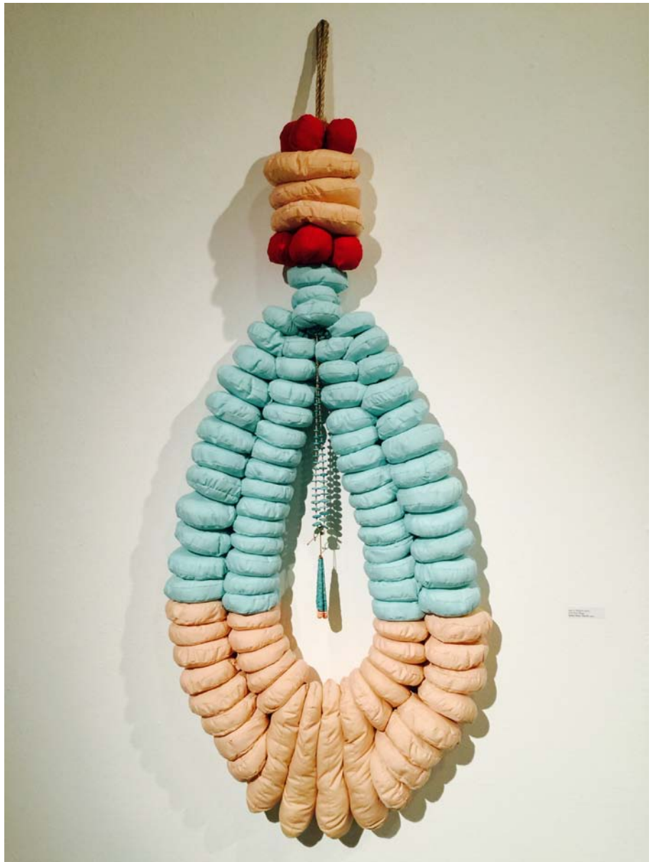
"yoo' 4 yé'itsoh; jacla" mixed fibers, fiberfill, wire, by Eric-Paul Riege, in the Department of Art 2017 Undergraduate Juried Show