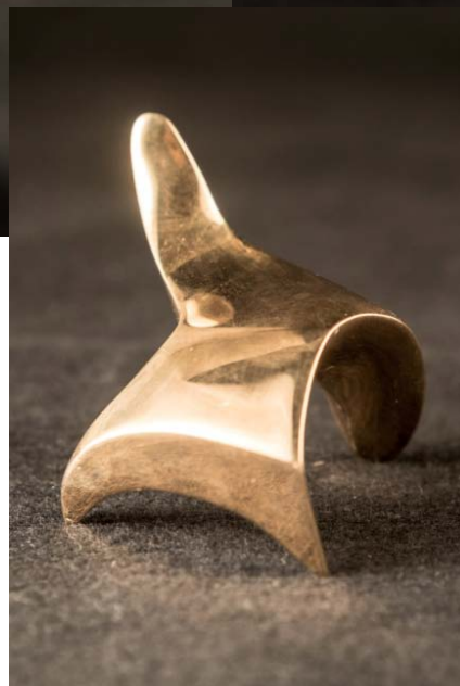
“Smooth Form,” bronze casting 2017, Stefan Sollenuis, Graduate Student