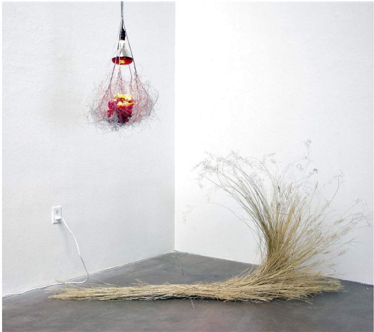
UNM Alumna Viola Arduini, "Beauty Needs Protection [A Flock of One Hundred Birds Flew East]", 2018 Grass, steel cables, heat lamp and one hundred paraffin-wax molds of duck hearts. www.violaarduini.com

See art.unm.edu for the most up-to-date course descriptions and finearts.unm.edu for College of Fine Arts information